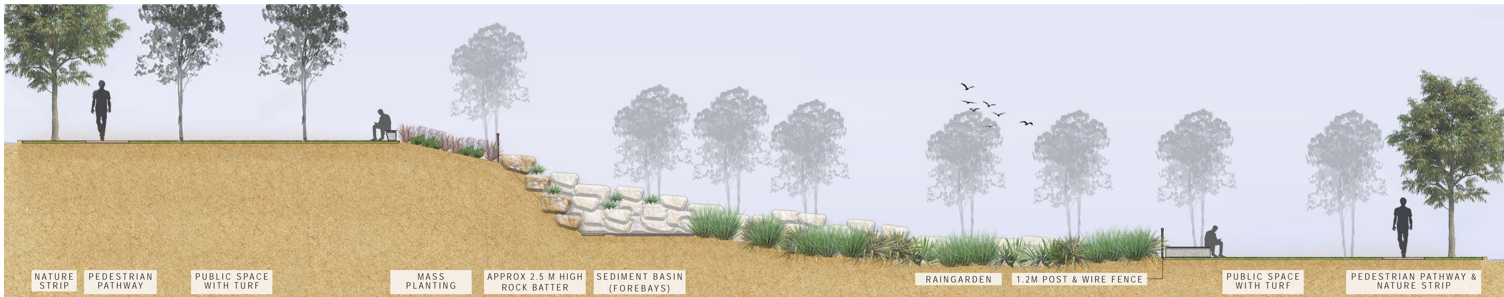
SECTION 1 | SCALE 1:100 @ A1