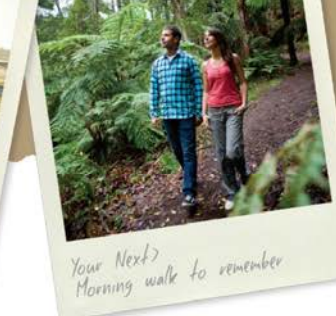
Your Next Morning walk to remember