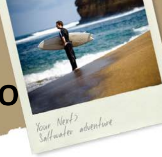
Your Next Saltwater adventure