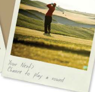
Your Next Chance to play a round