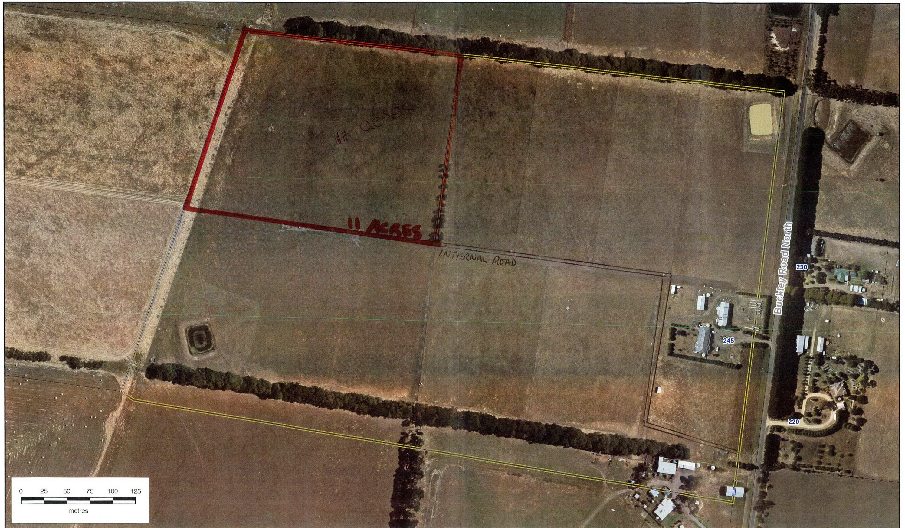
Map Scale: 1:2,500