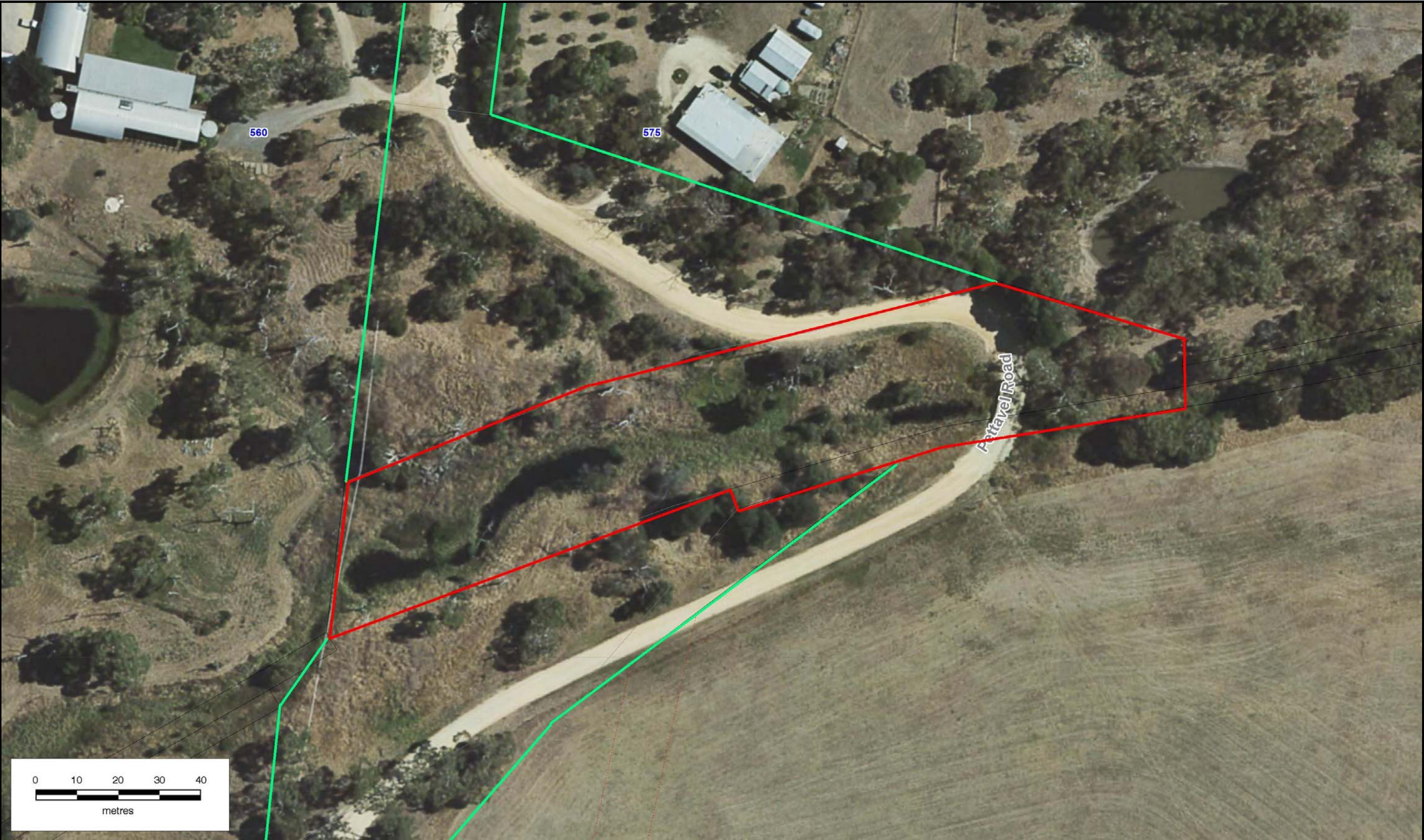
Map Scale: 1:880.7