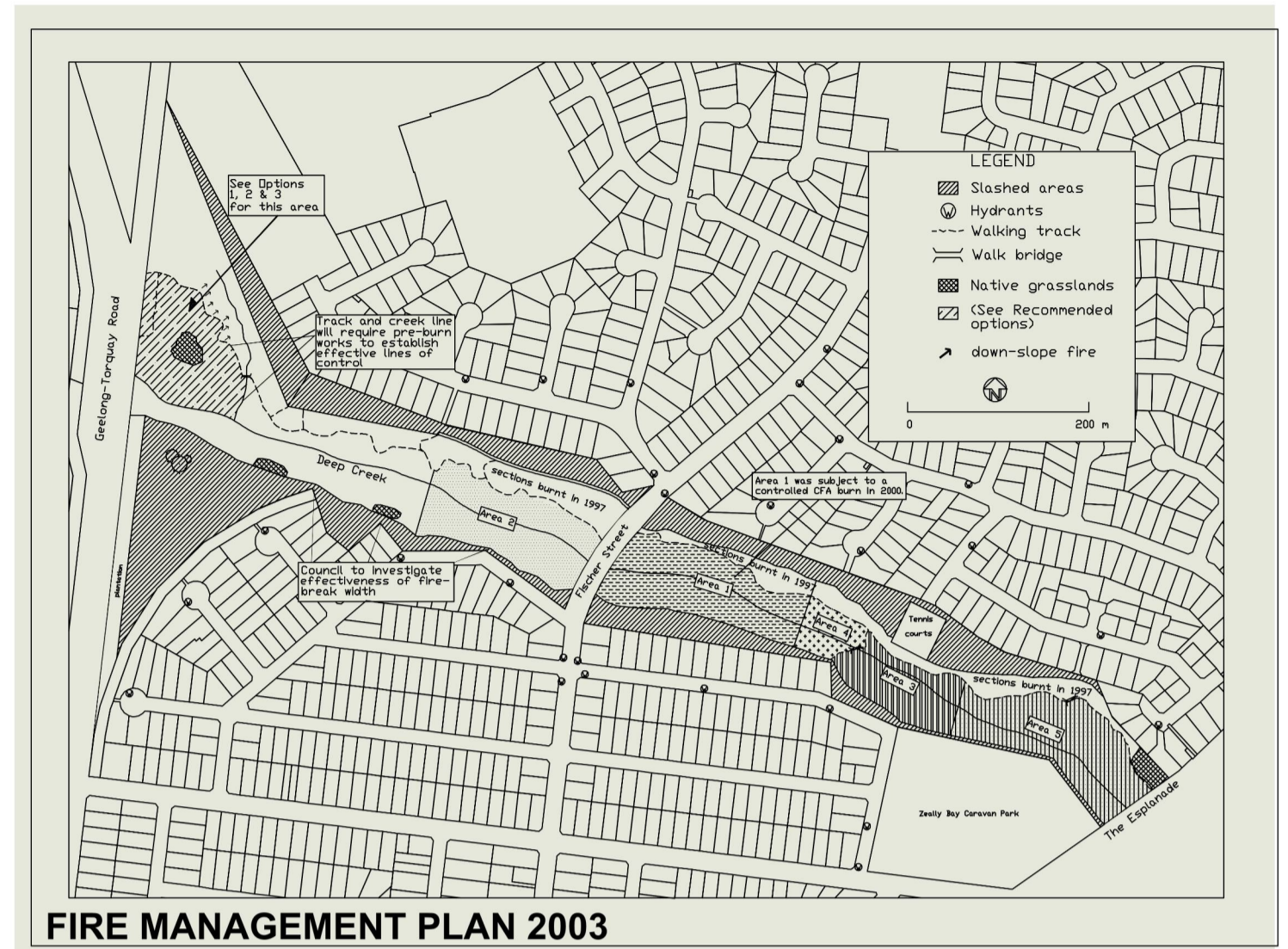
FIRE MANAGEMENT PLAN 2003