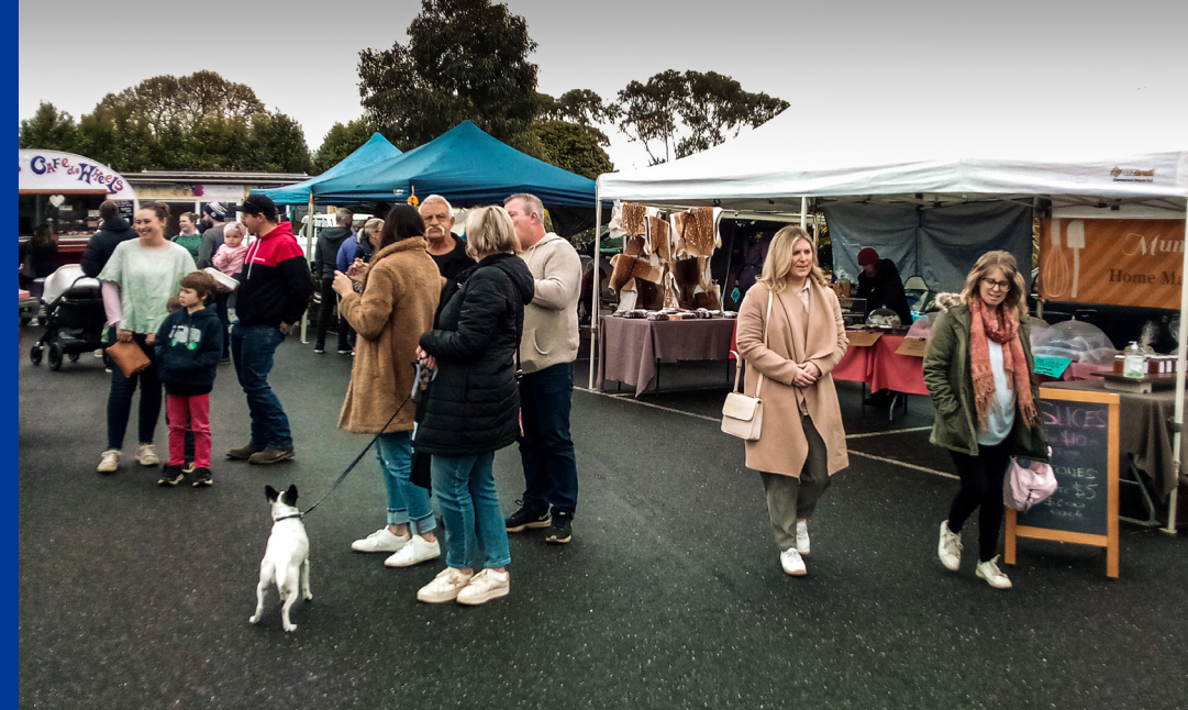
Winchelsea Market is on the first Sunday of each month.