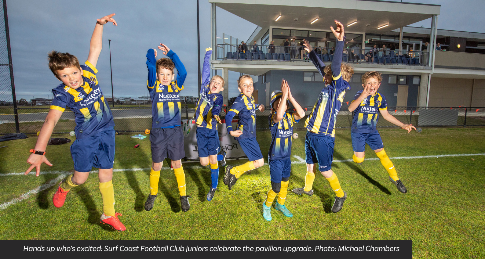
Hands up who's excited: Surf Coast Football Club juniors celebrate the pavilion upgrade.

People can visit surfcoast.vic.gov.au/pool to learn more about the project, see the plans and find a link to easily email politicians in the lead into the Victorian election.