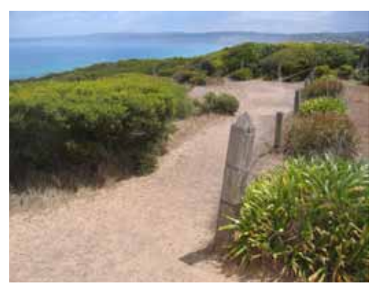
Some informal paths are so well worn that they are more inviting and used more often than the designated paths. This damages native vegetation and causes soil erosion.