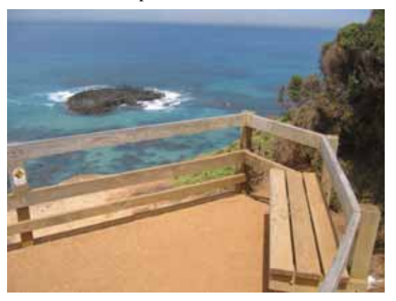
The precinct's lookouts are well sited but could be designed to reflect the uniqueness of their setting.