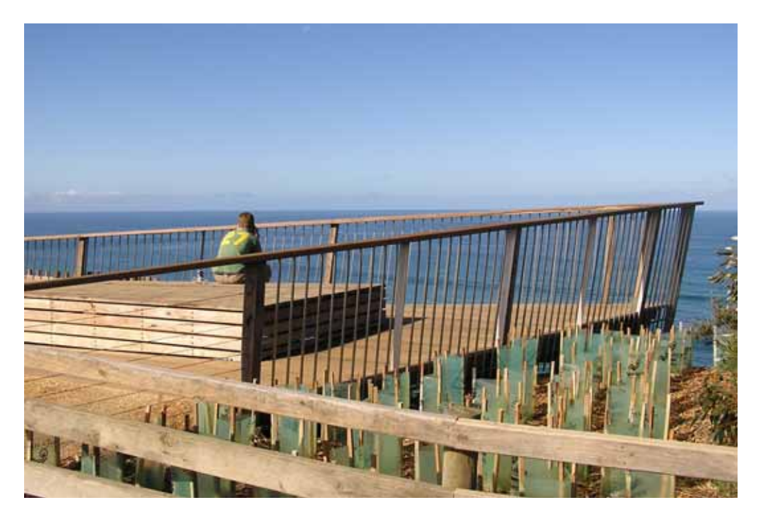
A1. above and A2. below: lookouts and boardwalks can be designed to pick up on the textures, colours and shapes of the surrounding natural landscape, celebrating local character. They must also meet basic needs for safety, comfort, shelter, views, and accessibility.