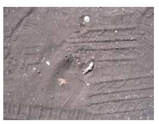
Parking on a midden adjacent to Inlet Crescent. The parking area and paths need to be redefined.