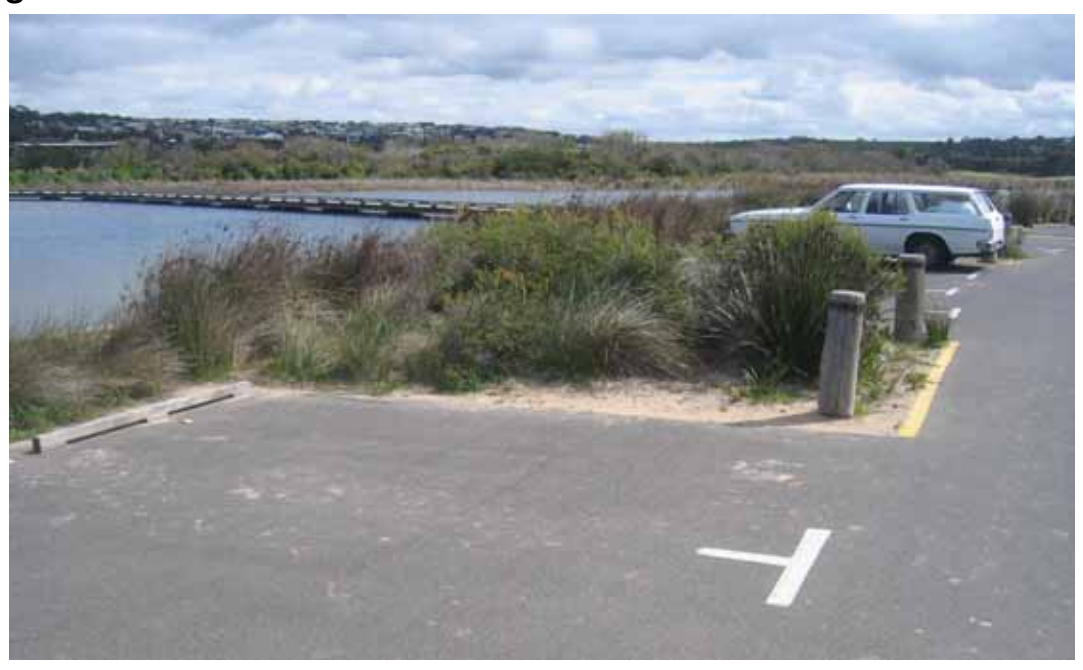
A5. above: defined right-angle parking bays like these, facing the estuary (but gravel surfaced), can be created at Inlet Crescent to increase parking capacity but decrease the visual and environmental impacts of parked cars. Barriers are kept low and unobtrusive.