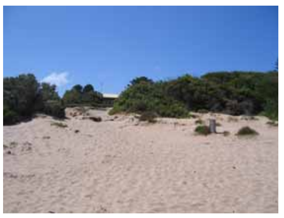
The main estuary and beach access path off Inlet Crescent is blowing out. A redefined, hardened accessway is needed to improve accessibility, reduce erosion and protect the nearby midden.