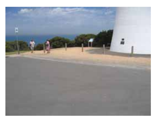
The lighthouse surrounds suggest a space for cars, whereas this is a space for people. The expanse of asphalt also diminishes the lighthouse's beauty.