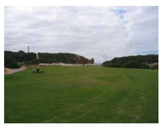
The grassy open space around the skatepark provides valuable recreational and social space and is part of an exceptional natural and heritage landscape.