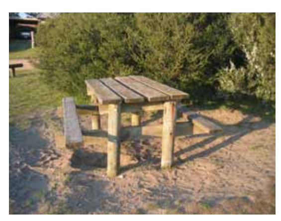
Worn-out picnic furniture is unpleasant to use and detracts from the precinct's aesthetic values.