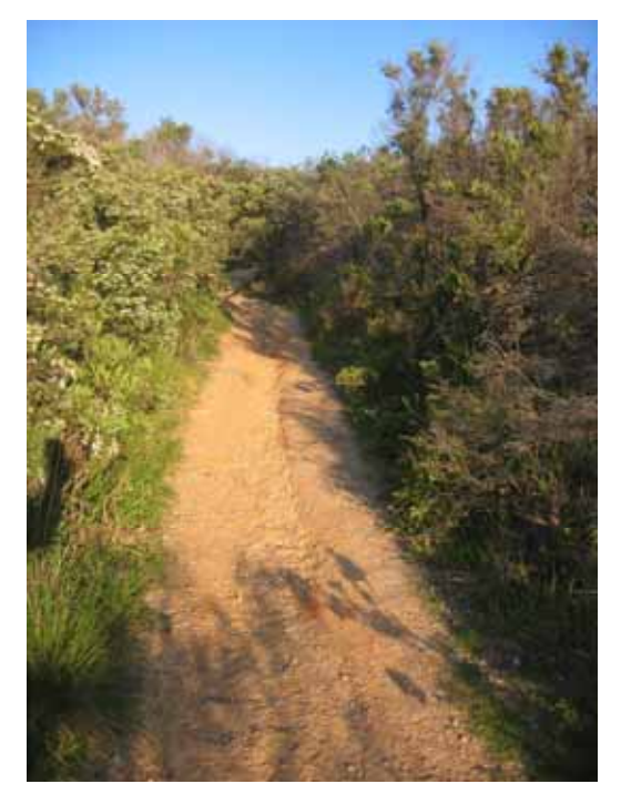
The Lighthouse Heritage Trail is the precinct's main pathway. The gravel surface limits access for people with disabilities and is erosion prone. A better path would encourage visitors to experience the precinct on foot