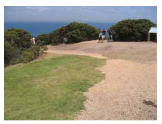
The pedestrian spaces at the lighthouse are too open, leading to confusion, ongoing vegetation damage and intense rainfall runoff.