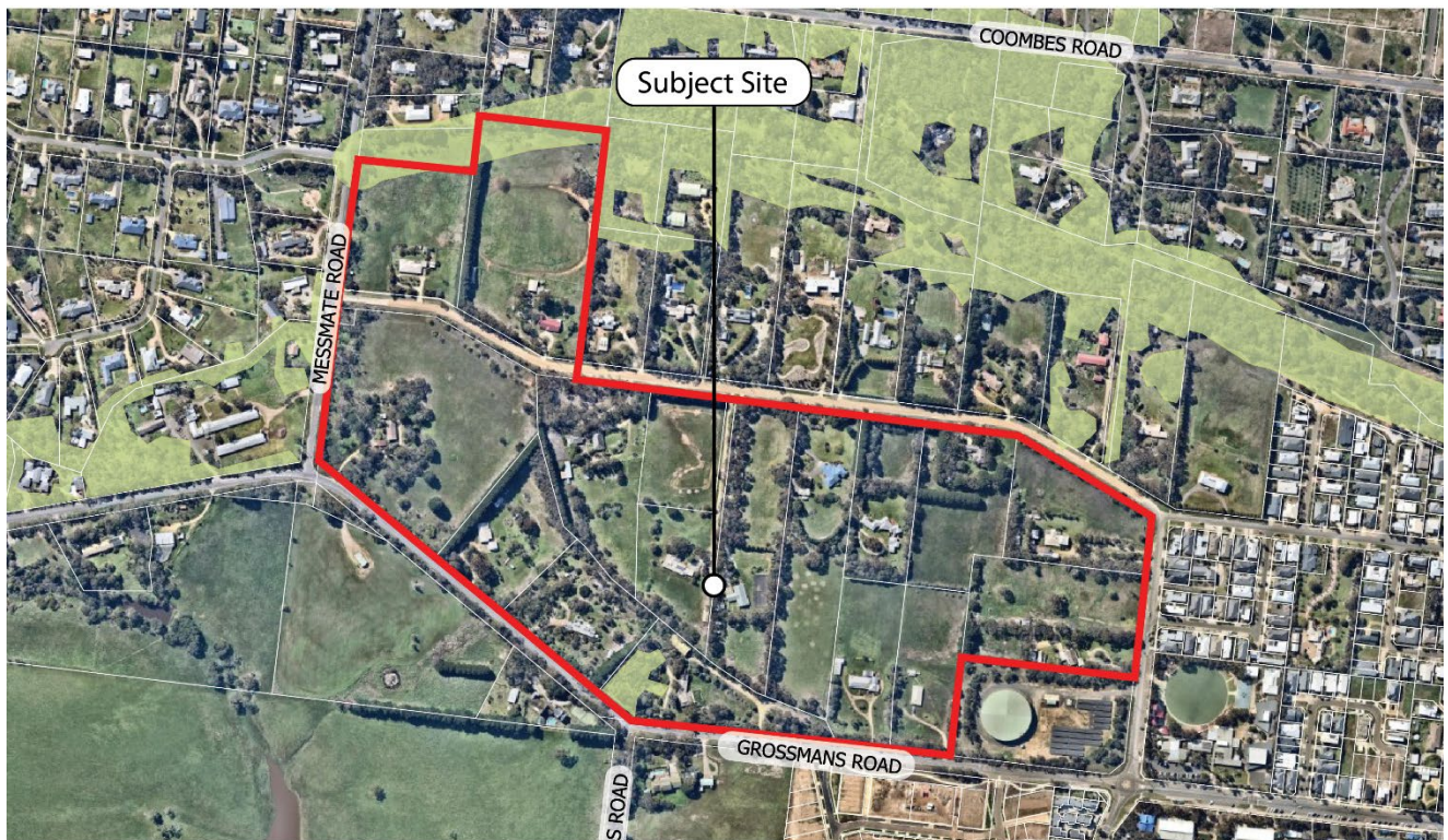
Figure 3 ESO Plan