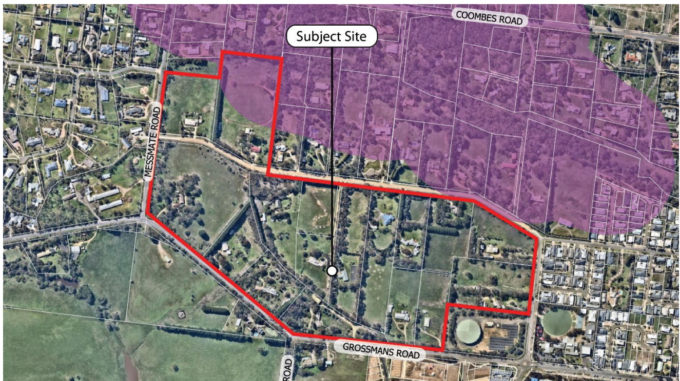
Figure 4 BMO Plan

DCPO2 more broadly provides for contributions towards infrastructure within Torquay – Jan Juc as identified in the Incorporated Document Torquay – Jan Juc Development Contributions Plan 16 May 2011 (Version 5 – March 2013) .