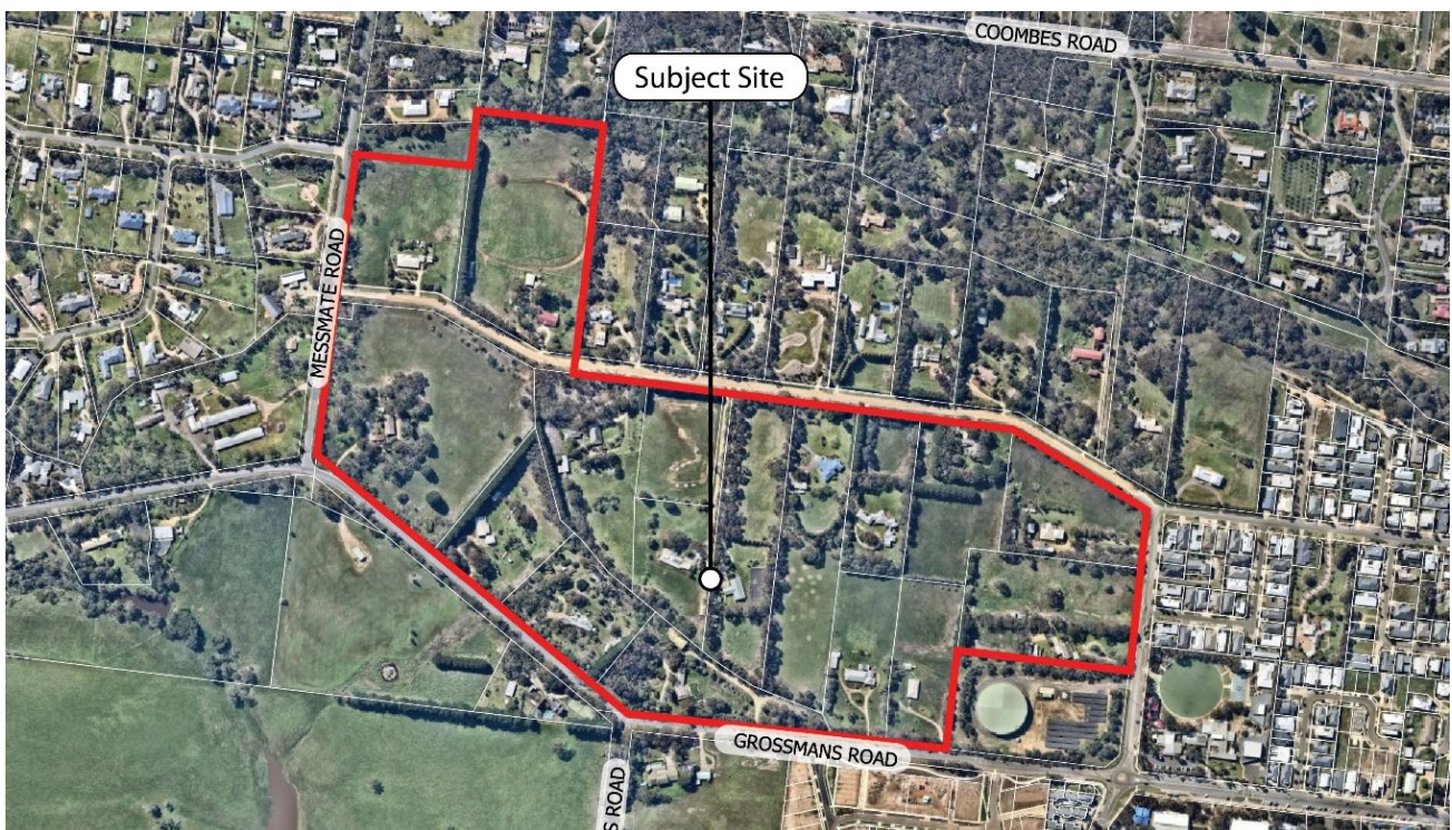
Figure 1 Site Aerial Plan

The Site currently accommodates 17 separate properties all developed in a low-density residential format. 16 of the lots accommodate a dwelling, one is vacant (forming part of the garden of one of the other properties). Due to the generous size of the lots many of the dwellings are accompanied by other outbuildings, extensive gardens and various levels of vegetation. The properties at 150 and 170 Briody Drive have a rear boundary which abuts the Deep Creek.