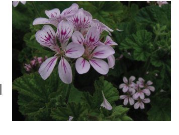
Aireys Inlet: L

Clump-forming hairy plant to 90cm, with soft, deeplyveined, lobed round or oval leaves. Clusters of pale pink, five-petalled flowers with deep-red markings.