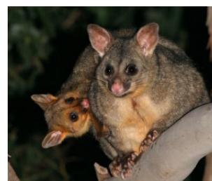
Spotted Pardalotes ( Pardalotus punctatus ) and Common Brushtail Possums ( Trichosurus vulpecula ) have been recorded in revegetation plantings

Revegetation plantings can also provide habitat at broader scales by increasing the overall amount of vegetation in the landscape. This is important because single patches of habitat (revegetation or remnant vegetation) are rarely enough to support viable populations of native animals in the long term. Also, many species move between different parts of the landscape for different purposes (e.g. to feed or to nest), or at different times of the year.