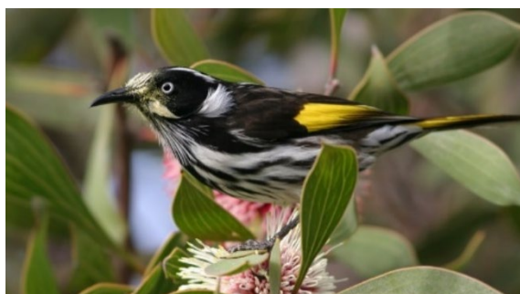
Flowering shrubs provide food resources for nectar-feeding species such as the New Holland Honeyeater ( Phylidonyris novaehollandiae )

These questions, and more, were examined in a large field study undertaken in Glenelg Hopkins region of western Victoria during 2019 and 2020. The study repeated bird and habitat surveys at a large number (>250) of sites that were established in 2006/07. These sites were selected to survey revegetation patches of different types, ages and amounts of surrounding vegetation, as well as nearby remnant vegetation.