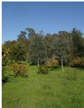
As plants mature, the habitat they provide changes