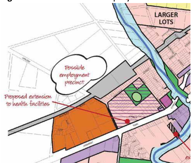
Figure 1: Possible Future Employment Precinct

In the 2015 Winchelsea Growth Strategy a possible future employment precinct north of the railway line was depicted (cloud depiction so as not to exactly define the development area). The possible employment precinct depicted in figure 12 in the Winchelsea Strategic Plan of 2015 successfully implements the above site characteristics providing an ideal location for future industrial development. Importantly the final criteria are fulfilled through a willing developer.