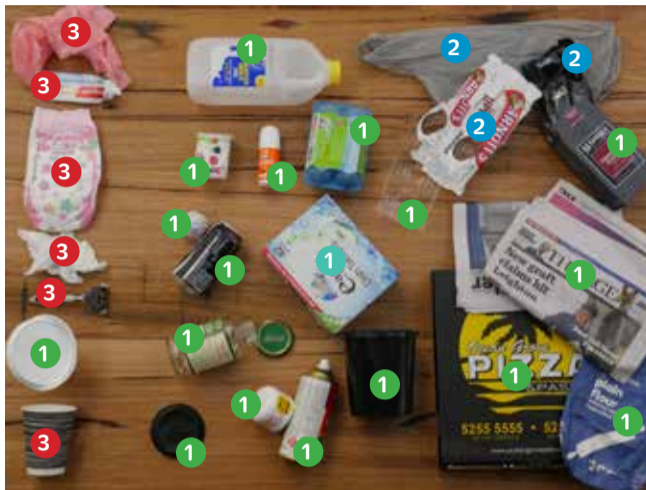
● Recycling ● Soft plastics ● Landfill

The picture (right) shows all of the items Cr Bell sorted for recycling (1), soft plastic collection at supermarkets (2) and landfill (3), and here are some accompanying tips: