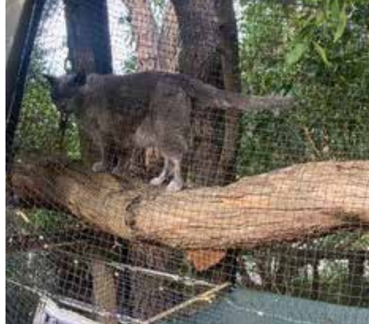
George climbing in his outdoor enclosure.