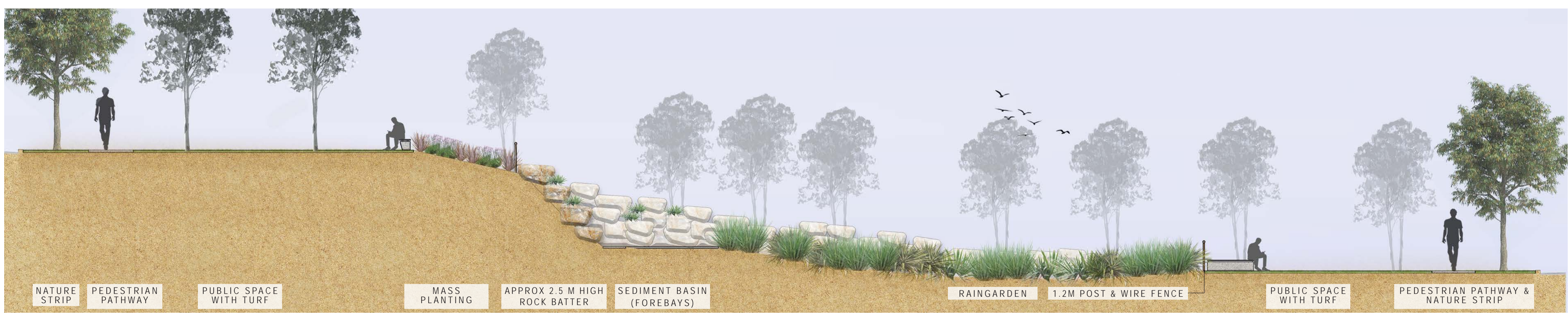
SECTION 1 | SCALE 1:100 @ A1

PLANNING & ENVIRONMENT ACT 1987 SURF COAST PLANNING SCHEME This Development Plan complies with the requirements of Clause 43.04 of the Surf Coast Planning Scheme Approval Number: PG20/0013 Date: 18/04/2024 Sheet No: 2 of 4 Digitally Signed by the Responsible Authority Tim Waller THIS IS NOT A BUILDING APPROVAL