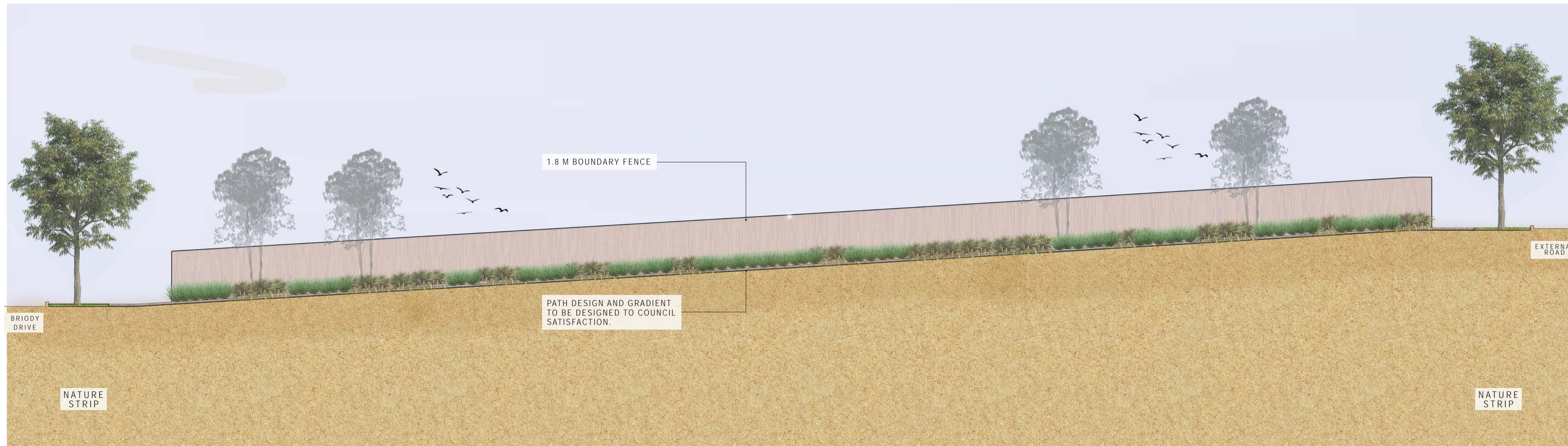
SECTION 2 | SCALE 1:100 @ A1