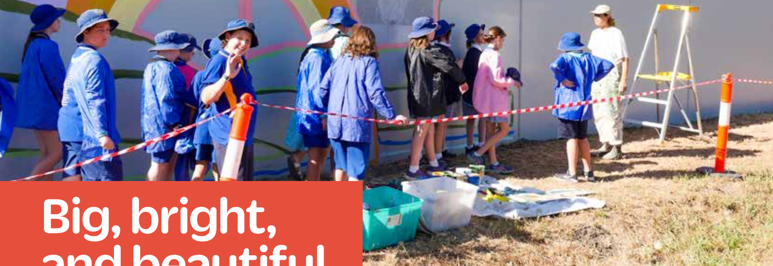
Winchelsea Primary School students helped paint the mural.